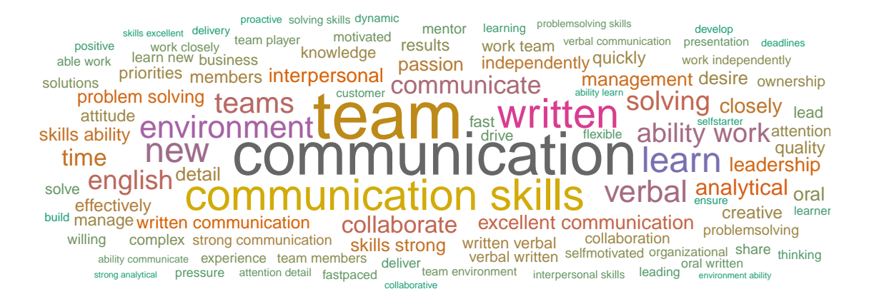
Figure 4: Soft skills word cloud.