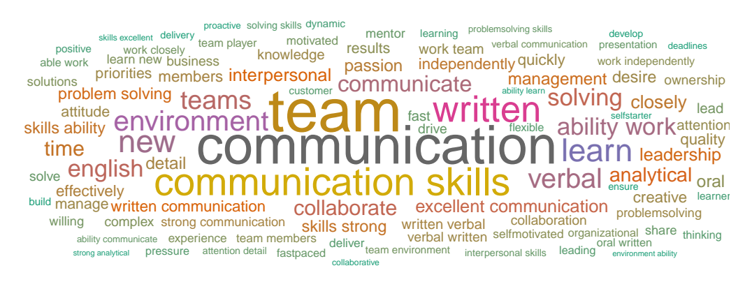
Figura 2. Soft skills word cloud.

Primarily, Languages is the most required hard skill for 9 out of 14 technical roles analyzed. Furthermore, the concentration of Languages is higher for development-based roles, e.g., MOBILEDEVELOPER (39.3%), GAMEDEVELOPER (50.7%), FULLS-TACKDEVELOPER (43.5%), and FRONTENDDEVELOPER (49.5%). These characteristics make Languages the only skills that are significantly mentioned in all roles. Likewise, development-based roles also demand skills on Libs & Frameworks , which generally have more than 20% of participation in this group.